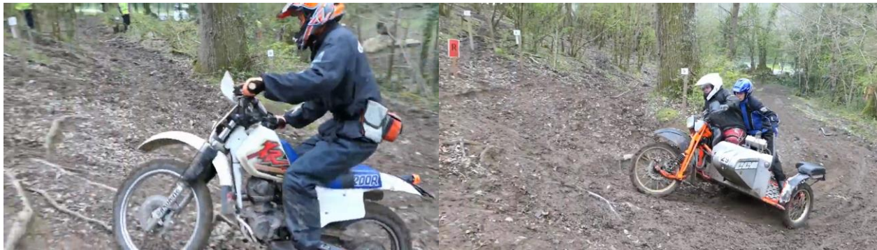
Best Solo 2019 – Tristan Barnicoat